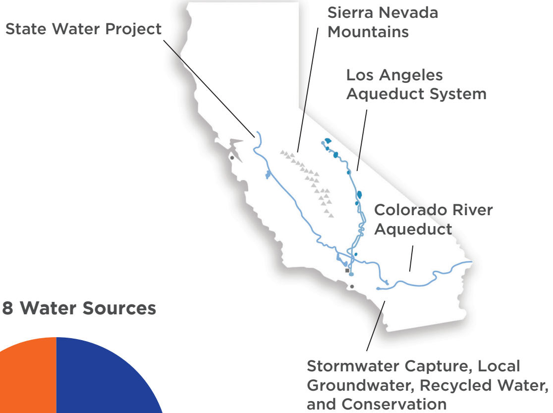
2018 Water Sources