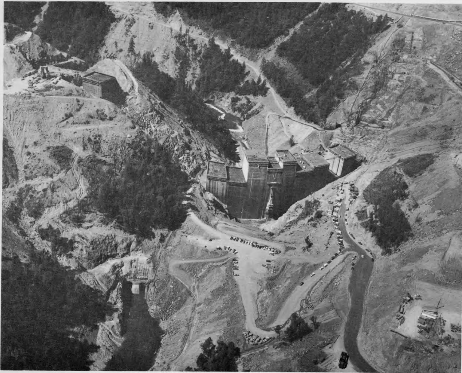
Aerial view looking downstream at construction of New Bullards Bar dam on the North Yuba River. The height of the block shown in the central portion of the arch is 300 feet above the streambed. The completed arch will rise 635 feet above streambed and impound 930,000 acre-feet of water.