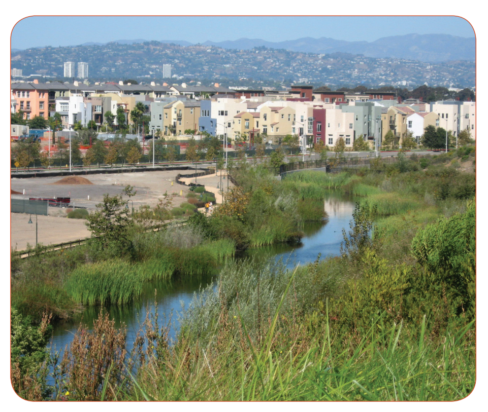
Urban stream near the southern California coast.

Given the evidence that pesticides are associated with ambient toxicity in California waters, certain emerging pesticides will be prioritized as SPoT monitoring proceeds. Because of increasing use and the potential for surface water toxicity due to fipronil, this pesticide has been included for statewide monitoring starting in 2013. Legacy pesticides, PCBs and organophosphates will be monitored less often.