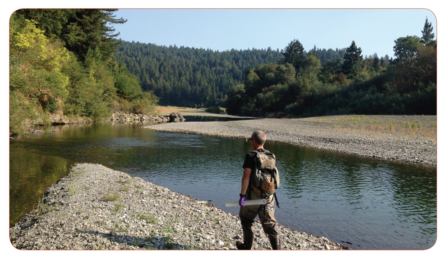
Sampling the Navarro River in Mendocino County.