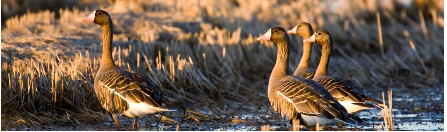
Waterfowl in rice field.