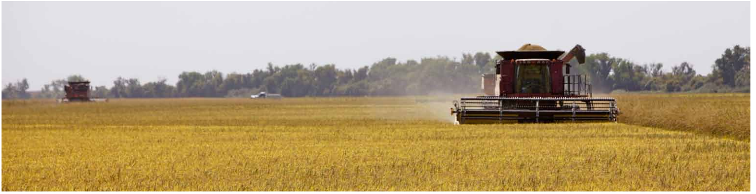
Rice harvest at Knaggs Ranch.

public policy and regulatory decisions are often made with inadequate or misleading information. Improved data access, greater transparency in data sources, and more collaborative interpretation and planning will facilitate a science-based approach to the connectivity of our food and water supply management decisions.