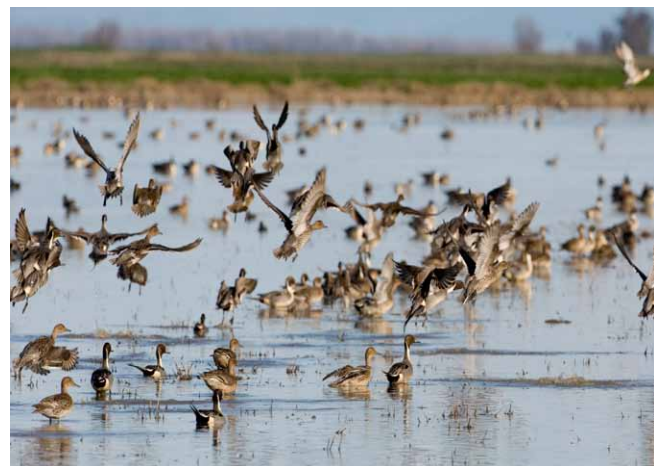
Opposite: Habitat on a farm in the Delta. Above: Waterfowl in rice field.

Balancing food production, habitat recovery, and flood protection into the future will hinge on their integration in the landscape and the extent to which that integration is valued and mirrored in historically siloed management approaches and institutions..