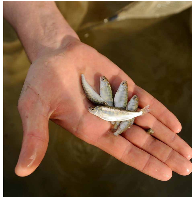
Opposite: Birds on Knaggs Ranch fields. Above: Juvenile Chinook salmon raised at Knaggs Ranch.

The Knaggs Ranch experiment in floodplain agriculture has received early acclaim for its success rearing juvenile salmon on winter inundated rice fields.