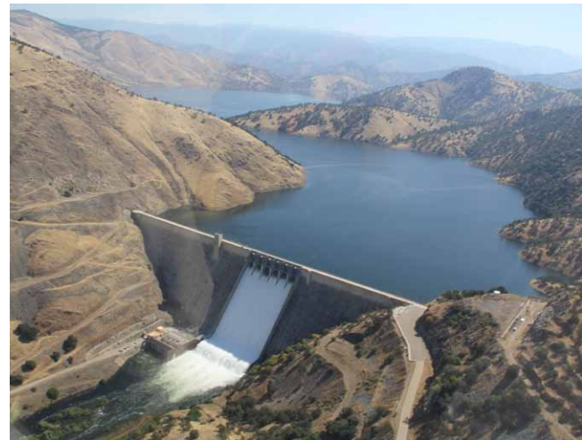
Opposite: Fresno Irrigation District's Jameson Pond Expansion, funded through a collaborative, consensus-based process of KBWA members. Above: Pine Flat Dam, representing the main water supply for the Kings Basin.

The formation of the Kings Basin Water Authority is a significant event supporting critical collaborations that have resulted in a number of very successful regional water solutions that generate connected benefits.