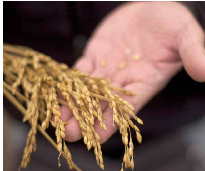
Rice grown at Knaggs Ranch.

Much of the currently available data are inconsistent and challenging to access and interpret. As a result,