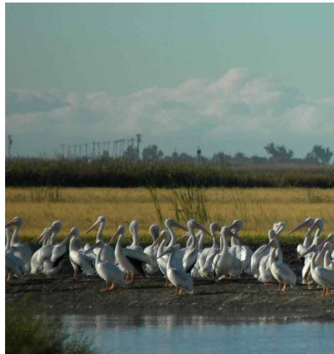
Opposite: Pintail utilizing the rice fields of the Yolo Bypass. Above: Pelicans at a pond near the freeway in the Yolo Bypass.

Benefits from the restored wetlands include habitat for hundreds of birds and other wildlife species, hunting, outdoor classrooms, birding, and fishing.