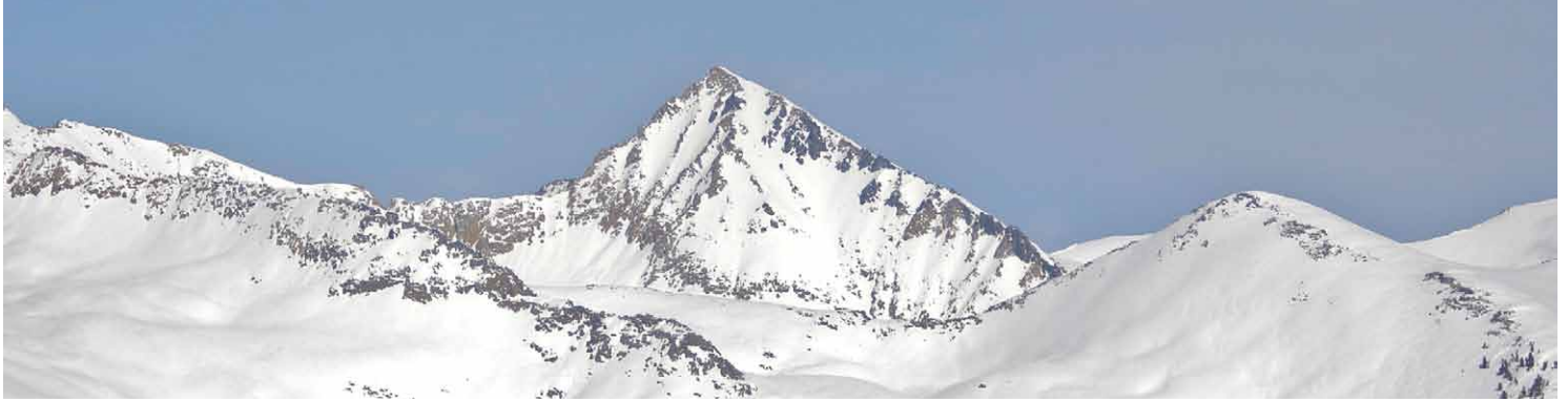
Above: The upper reaches of the Kings Basin water supply. Opposite: One Water One Watershed Pillar meeting.

the goals of the region has proven problematic. However, early performance trends are positive, and annual reporting on the voluntary regional water conditions plans help prioritize regional needs related to projects, additional planning, data acquisition, and outreach and education. In addition, integrated regional planning can benefit from developing common sources of knowledge, which contributes to achievement of connected benefits. In the case of KBWA, an integrated planning document and a regional hydrologic model provide important information about the current state of shared groundwater resources, while allowing KBWA to consider the impacts of different water management strategies. For example, the understanding by KBWA members of the nexus between land-use decisions and the hydrology of groundwater results in better planning of urban growth and agricultural development.