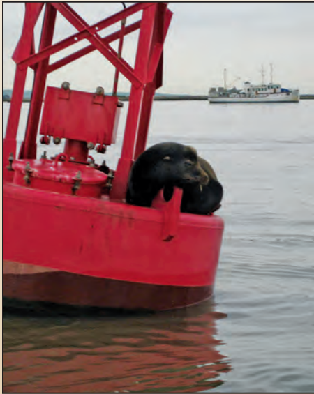
The U.S. Geological Survey’s Research/Vessel Polaris passes by a California sea lion ( Zalophus californianus) resting on a buoy in Suisun Bay. The research vessel has been facilitating scientific investigations in the Bay-Delta estuary for more than 40 years.

USGS scientists are also studying “stressors” to the Bay-Delta, including pesticides, trace metals, nutrients (such as nitrogen and phosphorus), and sediments in the waters of the system. USGS is currently enhancing the existing monitoring network with the establishment