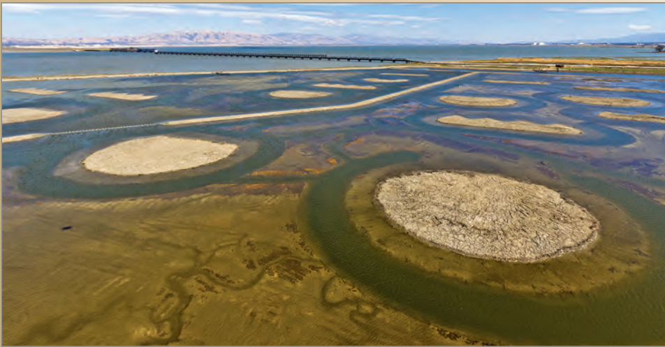
The U.S. Geological Survey guides restoration efforts in the South Bay Salt Pond Restoration Project. Engineered islands in a restored pond near Palo Alto, California, are used in an experiment to evaluate how the size and shape of an island affect waterbird nesting, resting, and feeding. Results will be used in future pond design to enhance opportunities for waterbird use and breeding success.

climate change, levee stability is a primary concern in the region. USGS scientists are characterizing the subsurface geology to increase understanding of the earthquake faults that could affect the Bay-Delta and its levees. They are also developing three-dimensional (3-D) maps to determine fault locations, maximum possible quake magnitudes and fault slip rates, and how seismic waves would behave in the sandy and peaty soils of the Bay-Delta. USGS is using innovative technologies, such as lidar (light detection and ranging; a “remote-sensing” technique), to better understand (1) how subsidence and other ground movements affect levees and (2) the effects of tree roots and rodent burrows on levee stability.