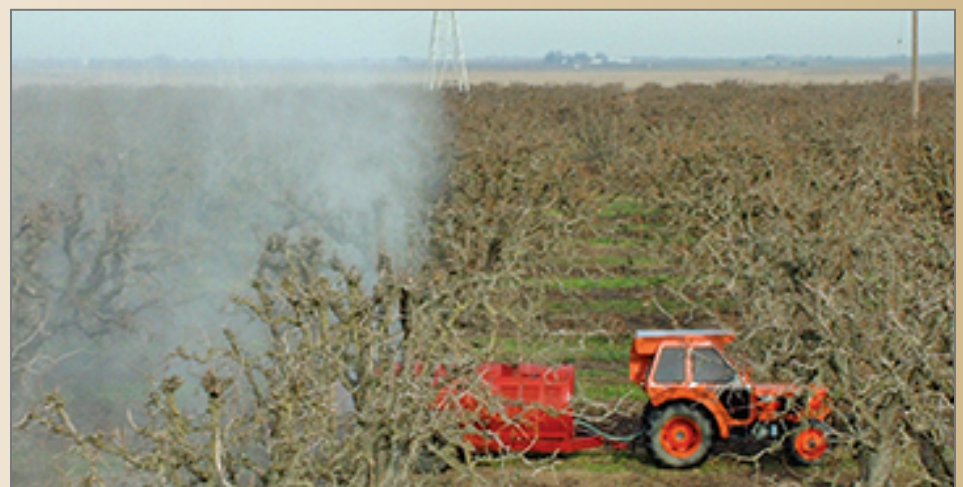
A pesticide spray is applied to a dormant pear orchard in the Sacramento-San Joaquin Delta. Agricultural and urban pesticides make their way into sediments and surface water through agricultural field and urban applications and runoff. Pesticides from such applications can also make their way into groundwater. The U.S. Geological Survey identifies and tracks pesticides in this watershed.

Agriculture in the Bay-Delta region accounts for a large part of California’s economy. This important industry currently uses a wide variety of pesticides. For more than a decade, USGS scientists have been conducting studies to determine the occurrence and long-term fate of a number of the pesticides used in the Bay-Delta