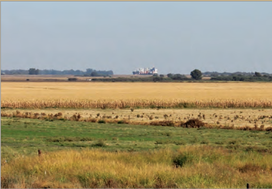
A cargo ship, heading for the Port of Stockton by way of the San Joaquin River, passes by subsided Twitchell Island. The island is surrounded by a reinforced levee that keeps surrounding waters, much higher than the island's surface, out. This is typical for an island in the central Delta.