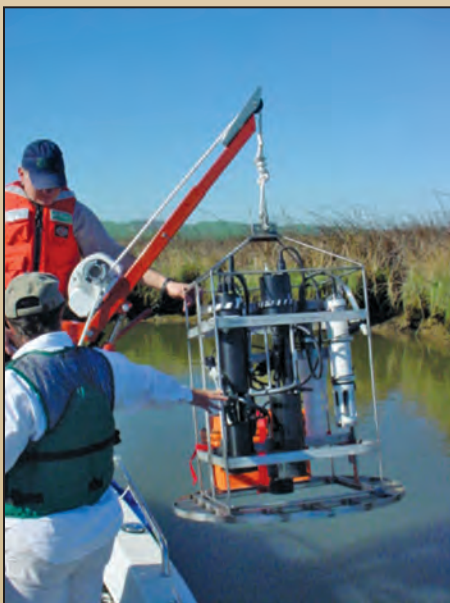
U.S. Geological Survey scientists deploying an optical instrument package at Browns Island, offshore of Pittsburg, California, to measure mercury, methylmercury, dissolved organic carbon, and nutrients in Bay-Delta waters.

of “super stations” at strategic locations to measure habitat quality. The enhancements include adding sensors to existing stations, as well as installing several new stations, to collect data every 15 minutes on a variety of habitat characteristics. These characteristics include nutrients, phytoplankton (microscopic plants), light penetration into the water, and dissolved organic material (such as that from plant remains). These potential stressors or characteristics may have biological and ecological consequences for the food web in the Bay-Delta, which in turn may affect the health of species populations.