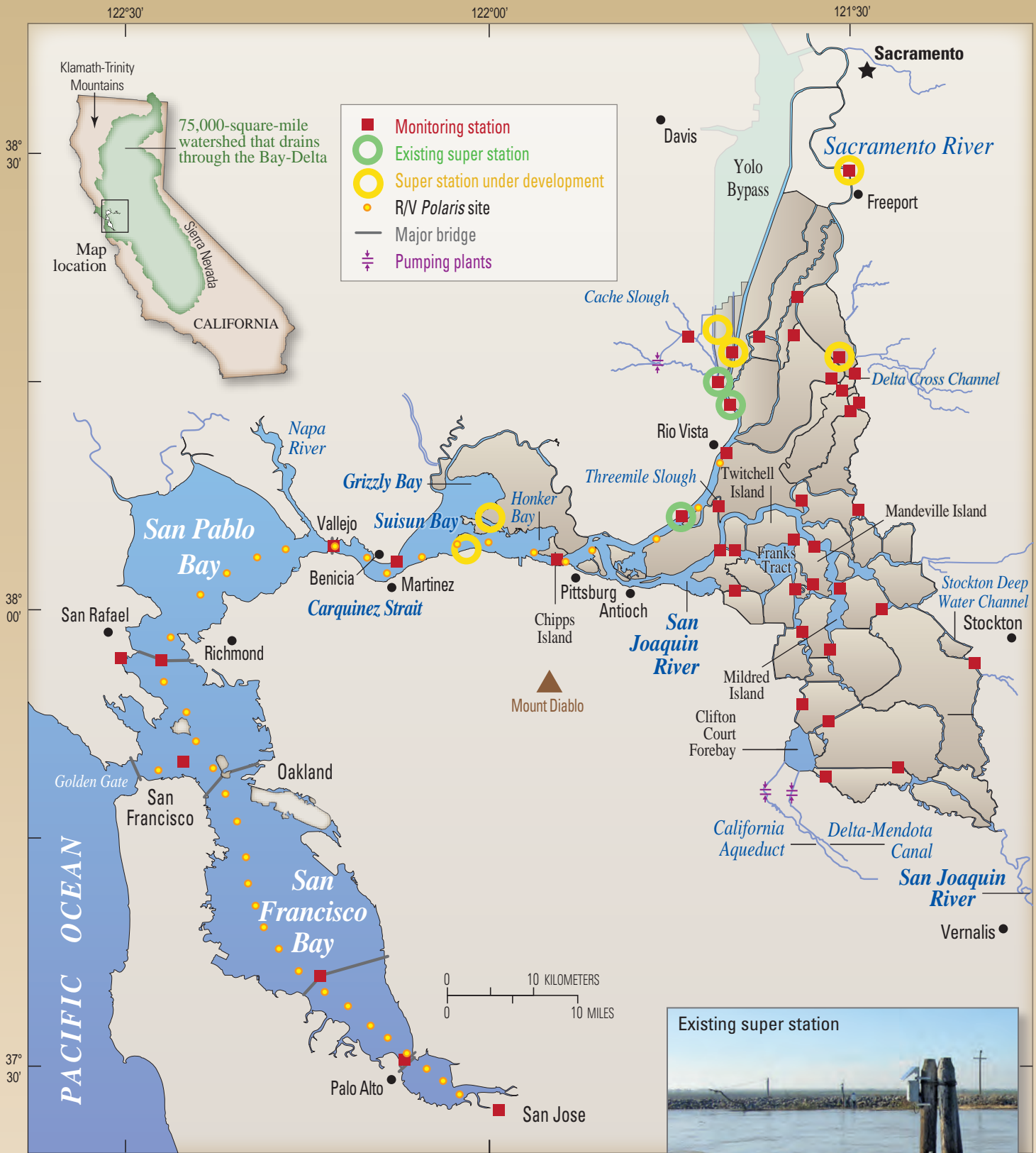
Map of San Francisco Bay and the Sacramento-San Joaquin Delta (the "Bay-Delta") region. This map shows significant features and the network of water-monitoring stations (red squares and inset photo) maintained by the U.S. Geological Survey (USGS) in the Bay-Delta. Also, the USGS Research Vessel Polaris conducts monthly sampling trips to monitor water-quality (at sites shown as yellow dots). Monitoring stations collect real-time data that vary by station and can include data on water flow and quality, depth, water clarity, electrical conductivity (salinity), and temperature. USGS is improving the monitoring network by establishing "super stations" (circles) to quantify key habitat-quality indicators (such as nutrients, microscopic plants, and light penetration), in addition to the established data collections, at strategic locations in the Bay and Delta. Data from the network are used daily by State and Federal officials to manage water movement in and out of the Delta for human and agricultural use and to detect changes in the waters of San Francisco Bay.